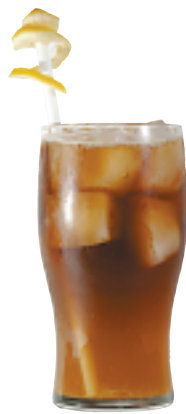
LONG ISLAND ICED TEA